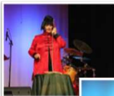
Thoroughly Modern Millie