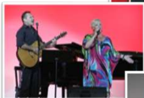
Bridge Over Troubled Waters!