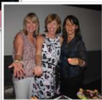
Lots of thanks to Our wonderful FOTA.